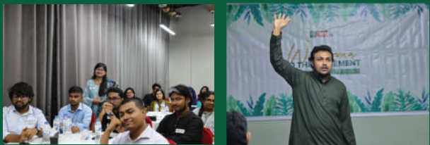
Photos: The 39 Accepted Fellows of the Fellowship 2027 cohort celebrate the start of their leadership journey, united by a shared commitment to ensuring every child has the opportunity to fulfill their potential.

The second quarter marked a major milestone in the Fellowship 2027 journey as Teach For Bangladesh welcomed 39 Accepted Fellows into the movement following a rigorous four-stage selection process. Representing a diverse group of graduates and young professionals, the new cohort demonstrated strong leadership potential, a commitment to social impact, and alignment with Teach For Bangladesh's mission of advancing educational equity.