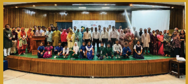
Photos: Education leaders, Fellows, students, and government stakeholders collaborate during the Head Teacher Engagement Program to strengthen partnerships for holistic student development.

This quarter, Teach For Bangladesh convened the Head Teacher Engagement Program (HTEP) in Rangpur and Cox's Bazar, bringing together educators, government officials, Fellows, students, and TFB staff under the theme "Collective Action, Lasting Impact."