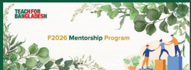
Photos: Accepted Fellows engage with current Fellows during the month-long Mentorship Program, gaining firsthand insights into the leadership, challenges, and impact of the Fellowship journey.

More than an orientation, the Mentorship Program strengthened Fellows' sense of belonging within the Teach For Bangladesh community while preparing them to begin their leadership journey with greater confidence, purpose, and commitment to advancing educational equity.