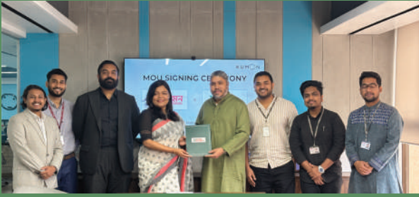
Photo: The MoU between Teach For Bangladesh and BRAC Kumon Limited establishes a shared commitment to developing education leaders and creating new opportunities for Alumni to continue driving impact through the Kumon Method.

BRAC Kumon Limited and Teach For Bangladesh have signed an MoU to explore a meaningful partnership aimed at strengthening Bangladesh's education ecosystem.