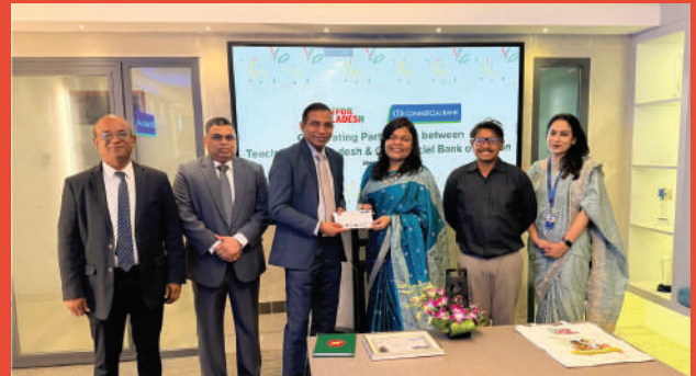
Photo: Through this partnership, Teach For Bangladesh and the Commercial Bank of Ceylon PLC will support over 25 Fellows, 2,750 students, 5,500 parents and caregivers, and 15,000 community members in creating safer, more inclusive learning environments.

Teach For Bangladesh has partnered with the Commercial Bank of Ceylon PLC to launch the Gender and Safeguarding Awareness (GSA) Initiative, strengthening efforts to create safer, more inclusive learning environments for children across Bangladesh.